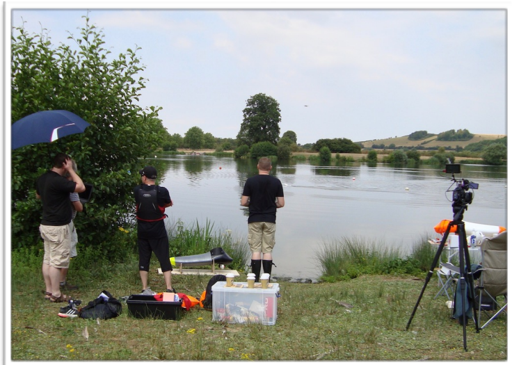
Trials/filming on the outside lake, Can you spot the drone?

After initial explanations of the project and unexpected directions the design took it was the involvement of Reading Bus Company as they have a large 3D printer, an invite down to Portsmouth to use the largest test tank in the UK to gain knowledge about behaviour of the model in various sea conditions, followed by trials at Beale Park outer lake and finally trials in Poole harbour navigating round Brownsea Island or at least that was the plan,