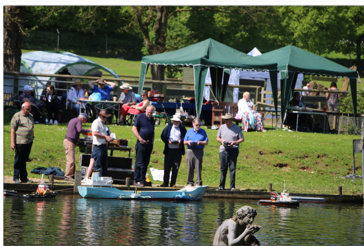
Warmer & sunnier times at the Beale Park Model Show in May