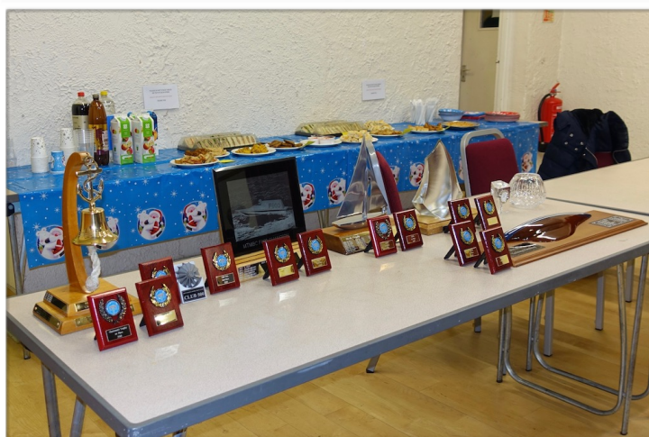
MTMBC Trophies and other goodies ready for the award presentations and consumption

The December evening meeting is the one where the lucky few are presented with their trophies for winning the various club organised events along with the runners up plaques followed by a buffet meal.