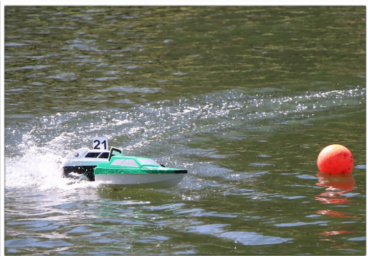
Some close Club500 racing at the Beale Park Model Show

Myself and Nathan Vosloo represented the Club at rounds 2 and 5 of the Electra championships here at Beale Park. Nathan taking victories in Mini Mono & Mono 1 in Round 2 and Mono 1 & Mono 2 in the 5th round. I finished first in Mini Mono in the 5th round.